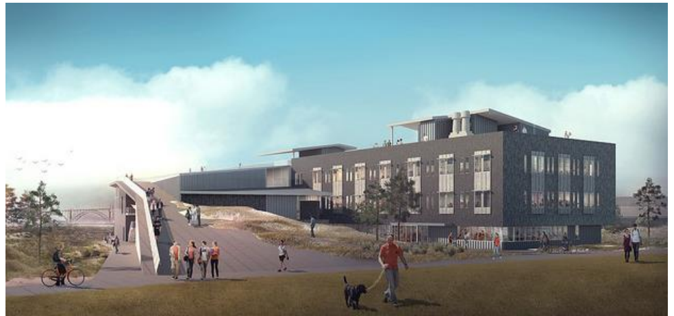
OSU's new building at the Hatfield Marine Science Center will serve as one of the first "vertical evacuation" tsunami sites in the U.S.

OSU-Cascades in Bend is the only baccalaureate and graduate degree granting institution based in Central Oregon. OSU-Cascades expanded to a four-year university when it welcomed its first freshman class in fall 2015, and graduated its first baccalaureate class in 2017.