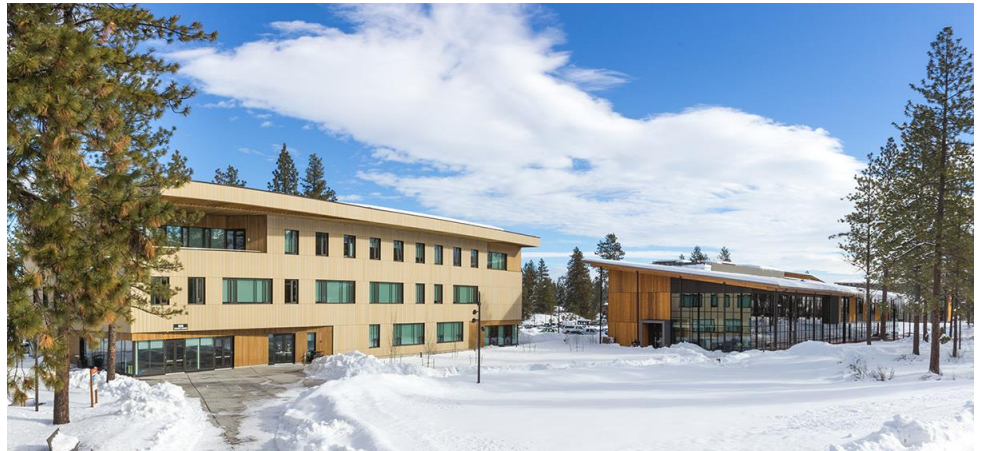
OSU-Cascades in Bend is the only four-year university serving the Central Oregon region.

OSU-Cascades in Bend is the only baccalaureate and graduate degree granting institution based in Central Oregon. OSU-Cascades expanded to a four-year university when it welcomed its first freshman class in fall 2015, and graduated its first baccalaureate class in 2017.