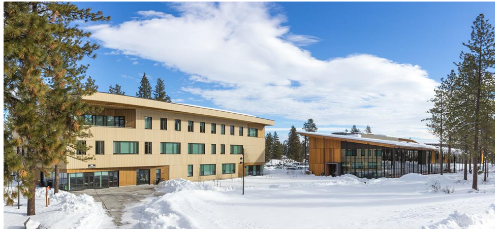
OSU-Cascades in Bend is the only four-year university serving the Central Oregon region.

OSU-Cascades in Bend is the only baccalaureate and graduate degree granting institution based in Central Oregon. OSU-Cascades expanded to a four-year university when it welcomed its first freshman class in fall 2015, and graduated its first baccalaureate class in 2017.