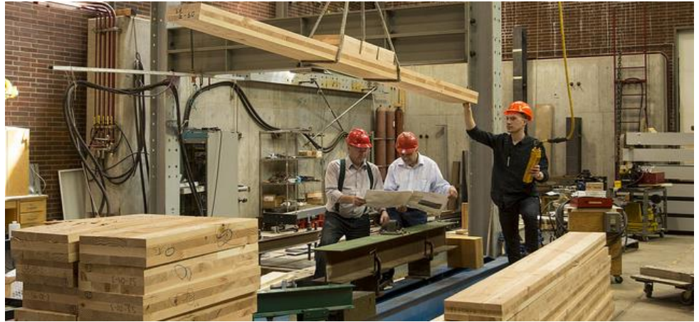
Cross-Laminated Timber (CLT) is a sustainable engineered wood product developed in the OSU College of Forestry and manufactured by several Oregon timber companies.

OSU-Cascades in Bend is the only baccalaureate and graduate degree granting institution based in Central Oregon. OSU-Cascades expanded to a four-year university when it welcomed its first freshman class in fall 2015, and graduated its first baccalaureate class in 2017.