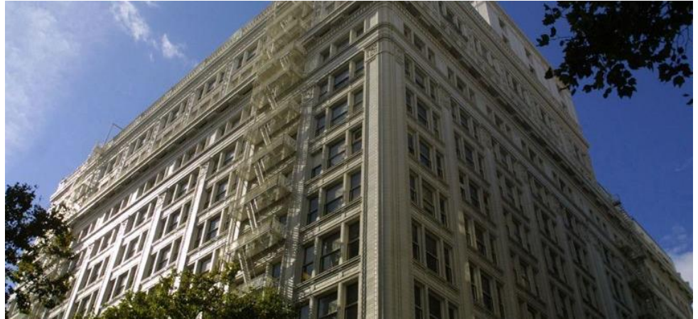
Oregon State University will serve the Portland region from the historic Meier & Frank building

OSU-Cascades in Bend is the only baccalaureate and graduate degree granting institution based in Central Oregon. OSU-Cascades expanded to a four-year university when it welcomed its first freshman class in fall 2015, and graduated its first baccalaureate class in 2017.