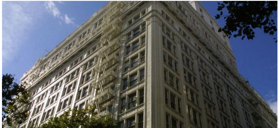
Oregon State University will serve the Portland region from the historic Meier & Frank building

OSU-Cascades in Bend is the only baccalaureate and graduate degree granting institution based in Central Oregon. OSU-Cascades expanded to a four-year university when it welcomed its first freshman class in fall 2015, and graduated its first baccalaureate class in 2017.