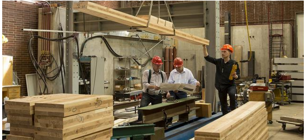
Cross-Laminated Timber (CLT) is a sustainable engineered wood product developed in the OSU College of Forestry and manufactured by several Oregon timber companies.

OSU-Cascades in Bend is the only baccalaureate and graduate degree granting institution based in Central Oregon. OSU-Cascades expanded to a four-year university when it welcomed its first freshman class in fall 2015, and graduated its first baccalaureate class in 2017.