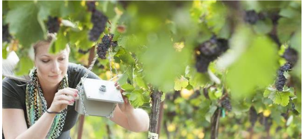
The Oregon Wine Research Institute collaborates with private partners to advance Oregon's wine industry.

OSU-Cascades in Bend is the only baccalaureate and graduate degree granting institution based in Central Oregon. OSU-Cascades expanded to a four-year university when it welcomed its first freshman class in fall 2015, and graduated its first baccalaureate class in 2017.