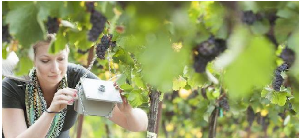
The Oregon Wine Research Institute collaborates with private partners to advance Oregon's wine industry.

OSU-Cascades in Bend is the only baccalaureate and graduate degree granting institution based in Central Oregon. OSU-Cascades expanded to a four-year university when it welcomed its first freshman class in fall 2015, and graduated its first baccalaureate class in 2017.