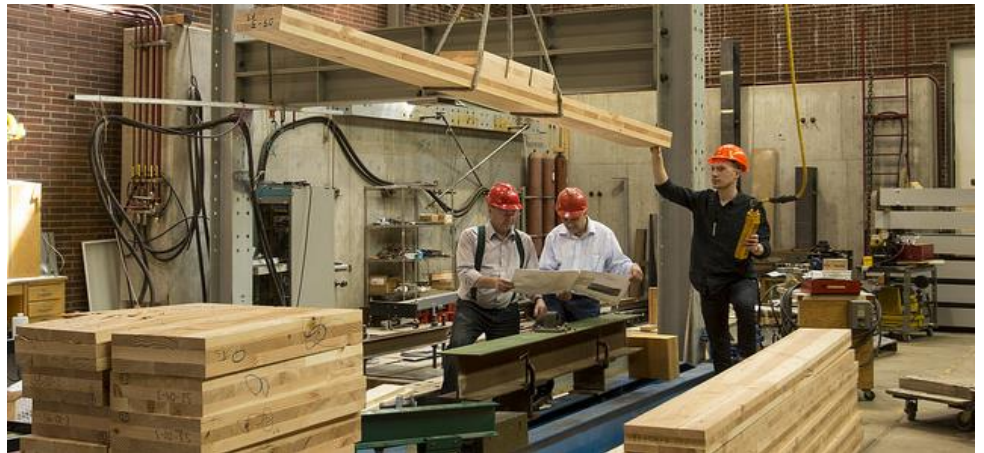
Cross-Laminated Timber (CLT) is a sustainable engineered wood product developed in the OSU College of Forestry and manufactured by several Oregon timber companies.

OSU-Cascades in Bend is the only baccalaureate and graduate degree granting institution based in Central Oregon. OSU-Cascades expanded to a four-year university when it welcomed its first freshman class in fall 2015, and graduated its first baccalaureate class in 2017.