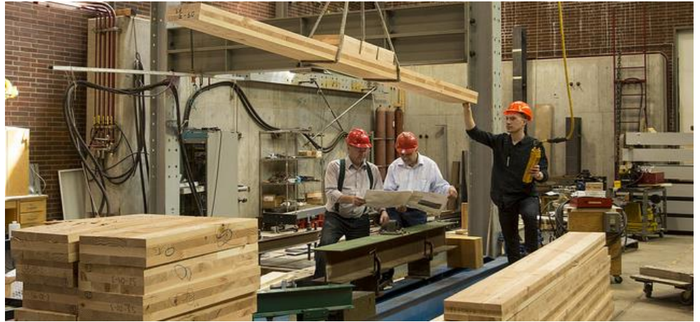
Cross-Laminated Timber (CLT) is a sustainable engineered wood product developed in the OSU College of Forestry and manufactured by several Oregon timber companies.

OSU-Cascades in Bend is the only baccalaureate and graduate degree granting institution based in Central Oregon. OSU-Cascades expanded to a four-year university when it welcomed its first freshman class in fall 2015, and graduated its first baccalaureate class in 2017.