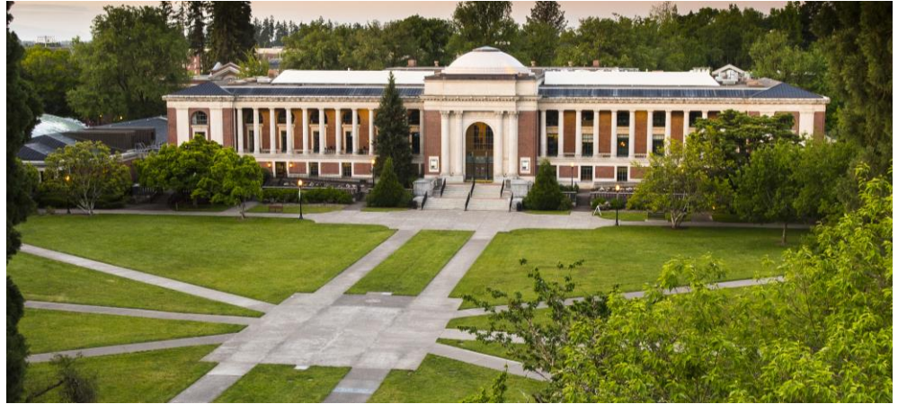
Oregon State University leaves a $2+ billion global economic footprint.

OSU-Cascades in Bend is the only baccalaureate and graduate degree granting institution based in Central Oregon. OSU-Cascades expanded to a four-year university when it welcomed its first freshman class in fall 2015, and graduated its first baccalaureate class in 2017.