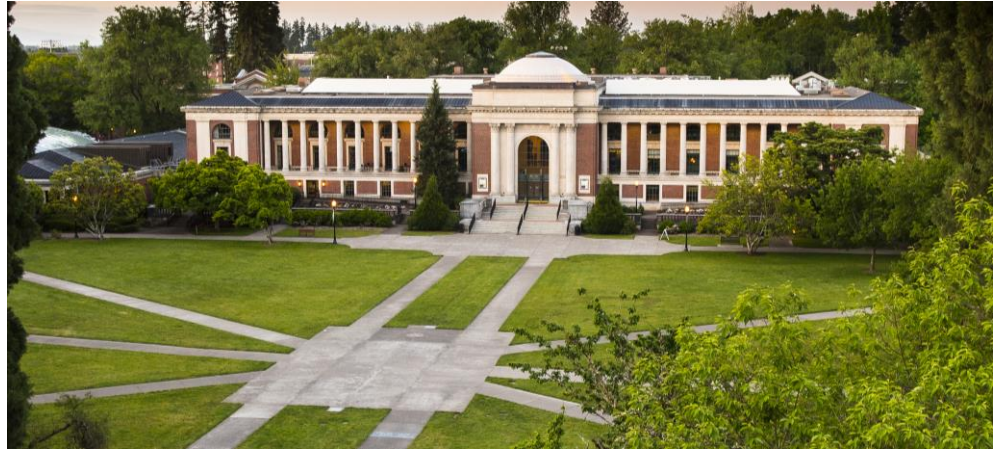
Oregon State University leaves a $2+ billion global economic footprint.

OSU-Cascades in Bend is the only baccalaureate and graduate degree granting institution based in Central Oregon. OSU-Cascades expanded to a four-year university when it welcomed its first freshman class in fall 2015, and graduated its first baccalaureate class in 2017.